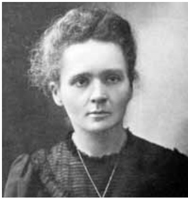
An Early Innovator—Madame Marie Curie (See pg. 19 for more details)