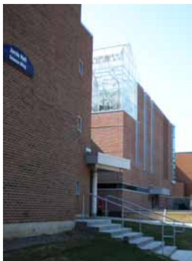
STEM Conference held at Jarvis Hall