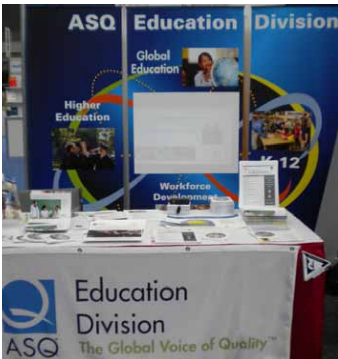
The Division’s booth at the 2011 WCQI.

Embracing a philosophy of “quality” sets educational organizations on a path of continuous improvement. Quality in education is important because it encompasses many best practices of organizational change. Key concepts embraced by quality school systems include: setting and communicating direction throughout the system; aligning goals at all levels; encouraging stakeholder participation in improvement efforts through teamwork, collaboration, and shared leadership; using data to guide decision making; and measuring customer satisfaction to name a few. Quality in education is designed to empower students,