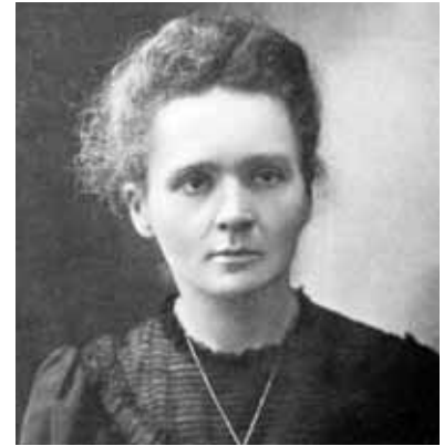
Madame Marie Curie